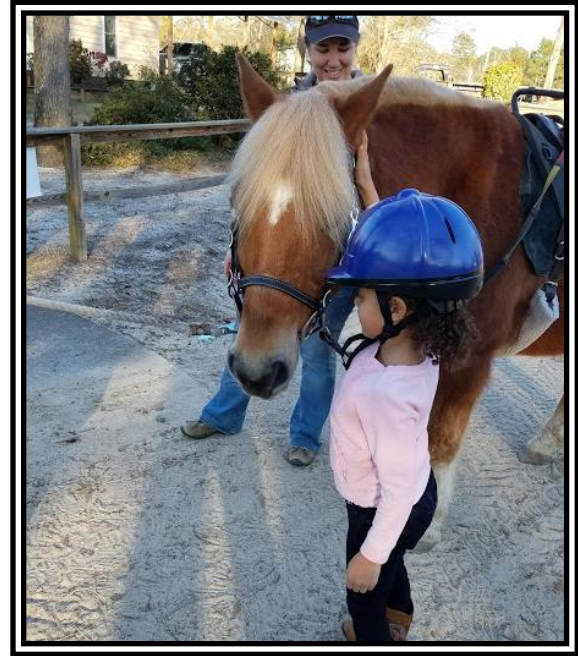
MALACHI, "MALCHI" REGISTERED HAFLINGER GELDING