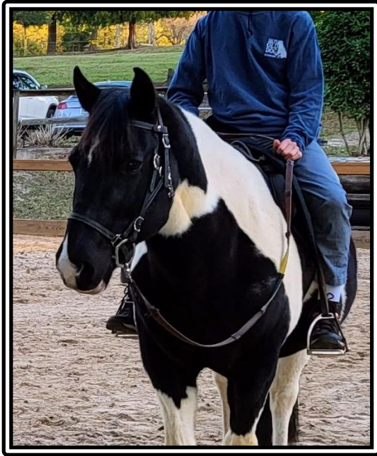
DASH Grade Paint Gelding