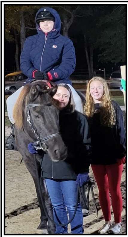
HONEY Registered Racking Horse Mare